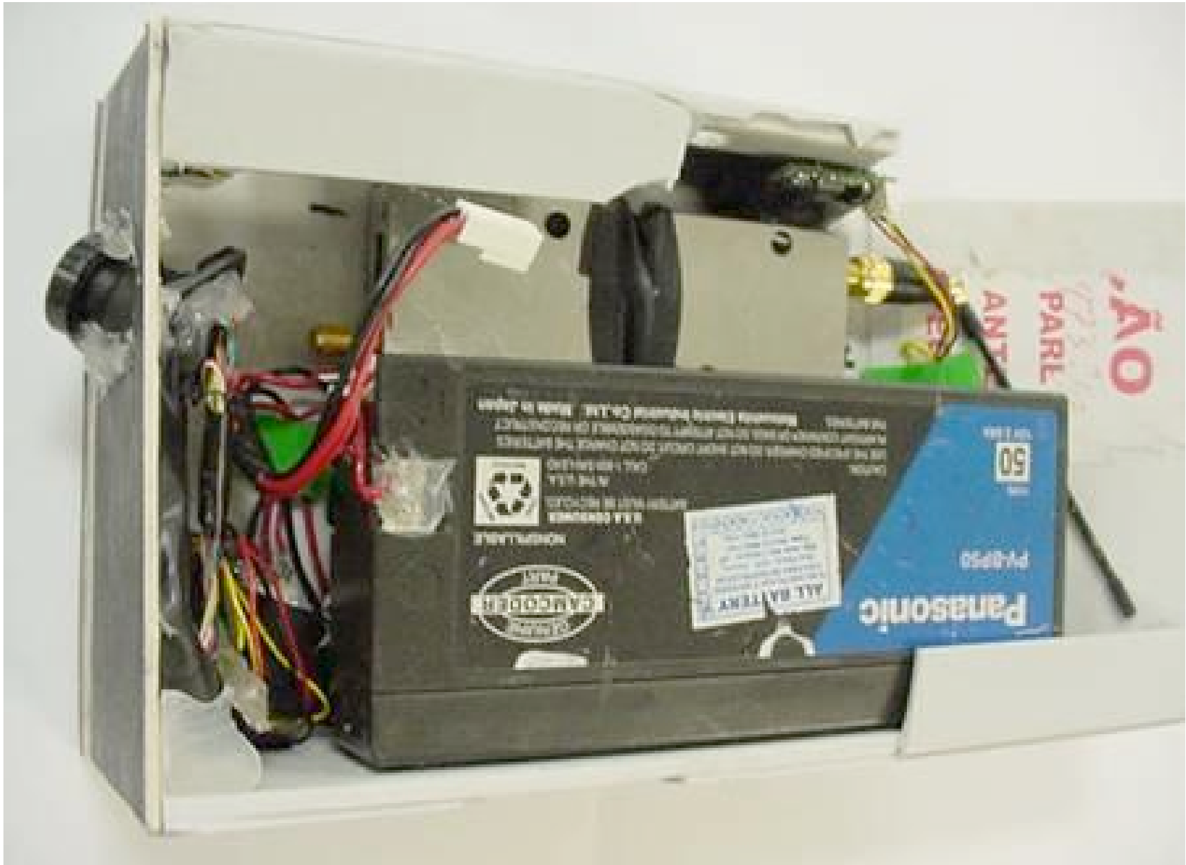
the camera has its own battery and transmission antenna