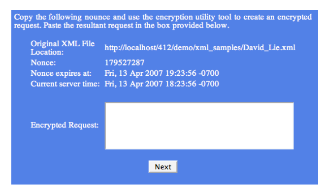
Figure 2. XML Profile Update Page

The second step is to generate the encrypted request message. The user should run the provided custom tool (shown in Figure 3), and provide the private key, the server-provided nonce, and the desired new location of the XML profile. After clicking the "Encrypt" button, an encrypted request message is generated.