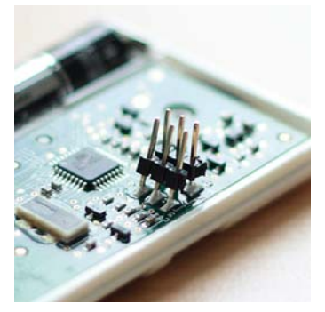
Fig. 1. Header pins soldered to ISP port

transceiver, was used to enable RF communication. It is theorized that one could develop a device based upon the XE1203F module that could intercept and decode wireless i>clicker traffic. The process of reverse engineering i>clicker wireless transmissions is not further addressed during the course of this analysis; however, as a general guide it is offered that one could attempt to look for a known clicker ID accounting for obfuscations before transmission outlined in Section C – Service Disruption.